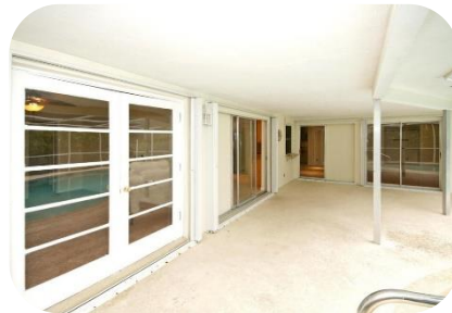
Patio off master bedroom, dining, and family rooms