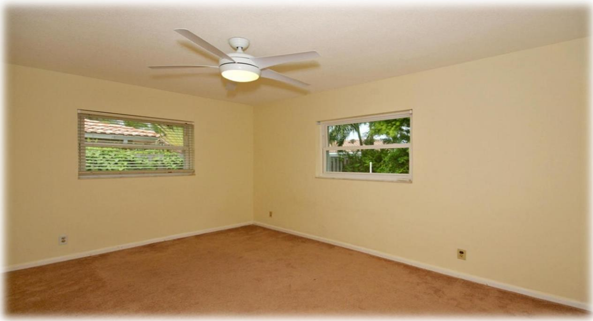
SECOND BEDROOM AT BACK OF HOUSE