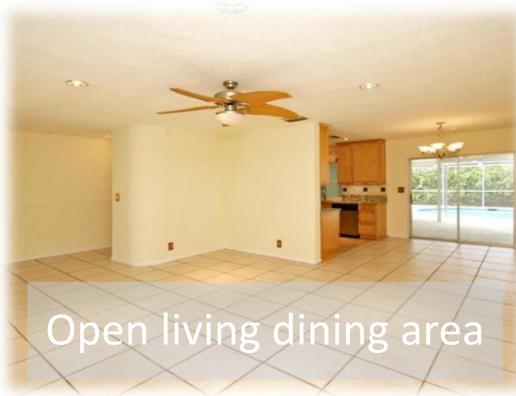
Open living dining area