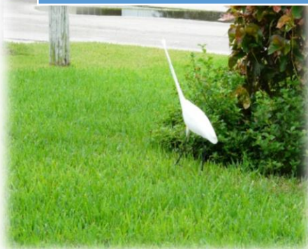
Owner's photos of Egret in front yard

A wonderful place to live for sale on quiet street in East Boca, east of Federal Highway, six houses from the Intracoastal Waterway. A pool house with three bedrooms three baths and a bonus room or fourth bedroom off the patio. Located in Bel Marra neighborhood without any HOA fees. A great home for entertaining or just kicking back and enjoying the mild wonderful weather of south Florida.