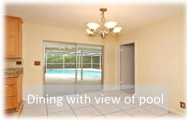
Dining with view of pool

Contact 561-542-4495 between 11 AM and midnight EDT for additional information