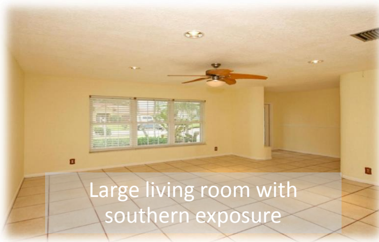
Large living room with southern exposure

Contact 561-542-4495 between 11 AM and midnight EDT for additional information